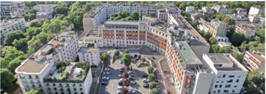
The American Hospital of Paris Foundation celebrates its 40th anniversary this year.

The American Hospital of Paris provides quality care you know in a place you don't.